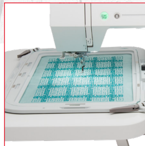
Maximum Embroidery Size: 7.9" x 14.2"