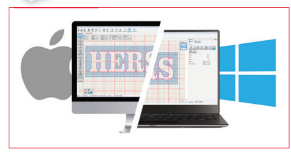
MAC and PC Compatibility with a common user interface