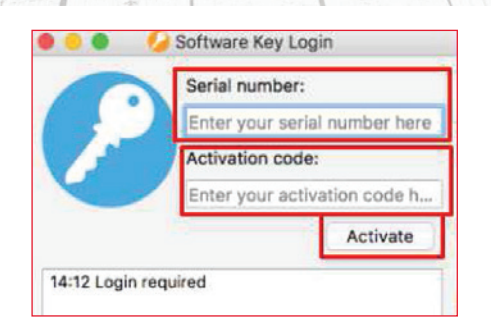
Software key login: Install the software an unlimited number of times, log in to use at any time.