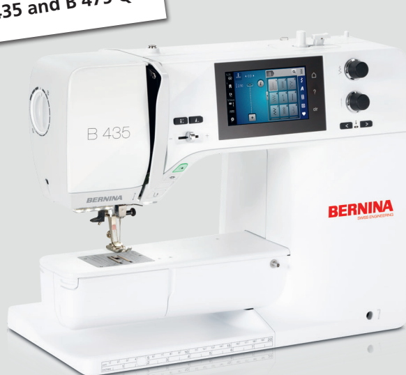
B 435 and B 475 QE

Talented. Energetic. Creative. Bold. A maker like Tiffany relies on the B 435 and B 475 QE to be powerful, easy to handle, fast and magical. Day in and day out. And her BERNINA never fails to deliver. She loves it and you will too.